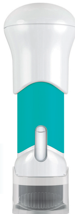
Not actual size

*TREMFYA® is a 100 mg injection taken under the skin at weeks 0 and 4, and then every 8 weeks. Your first self-injection should be performed at your doctor's office so he or she can show you the right way to give yourself the injections. After this training, and with your healthcare provider's approval, you may be able to inject at home.