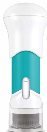
Not actual size

A patient-controlled self-injection device that was created with you in mind. The One-Press device features an easy-to-hold design. And if you're not a fan of seeing needles, you're in luck: One-Press has a hidden needle feature so you won't see the needle unless you go looking for it.